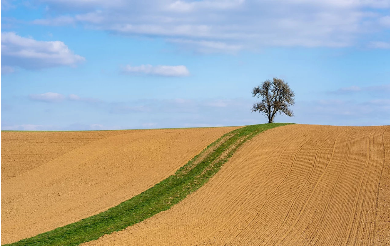
Photo 1: Neudenau, Germany, district Herbolzheim: sloping up bare fields, a track with green grass and a lonely pear tree near the Hohe Strasse southeast of Herbolzheim.

quis egestas. Cras pharetra imperdiet sodales. Sed rutrum ipsum aliquam nibh viverra ornare. Aliquam id nulla nec est lacinia malesuada id nec risus. Etiam aliquam ante hendrerit urna tincidunt eleifend. Aliquam erat volutpat. Donec consectetur sodales libero ac porta.