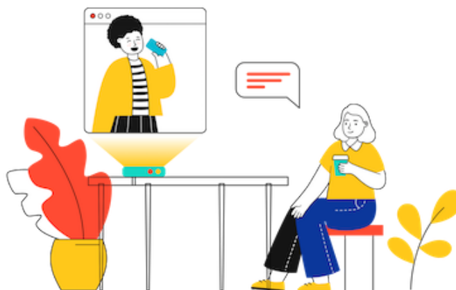
Image: blush.design All Illustrations published on Blush can be used for free. Licence.

Maecenas imperdiet tempus felis sed hendrerit. Etiam ornare placerat augue sit amet sollicitudin. Cras a posuere nibh. Aliquam lobortis imperdiet magna. Curabitur fermentum lacinia consectetur.